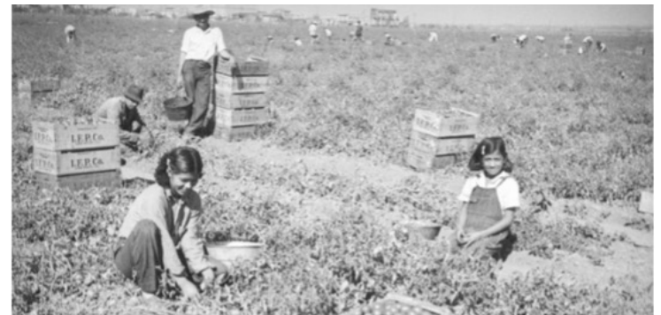
Migrant workers play a major role in the agricultural history of Fresno and many were among the St. Agnes and St. Anthony's first parishioners.