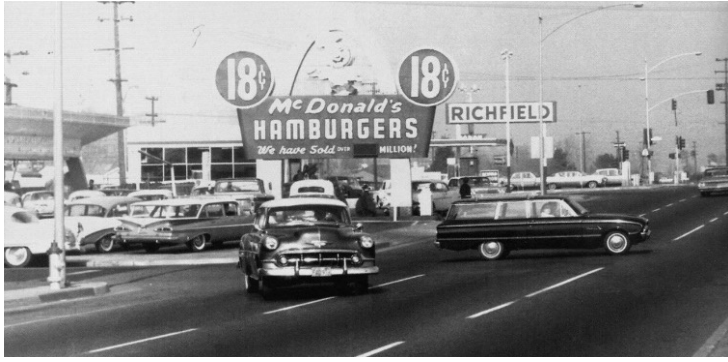
During this time, Shields Avenue was considered the edge of town. The first McDonald's was built at the corner of Blackstone and Shields. At the time, the current location of St. Anthony Church was fig orchards.