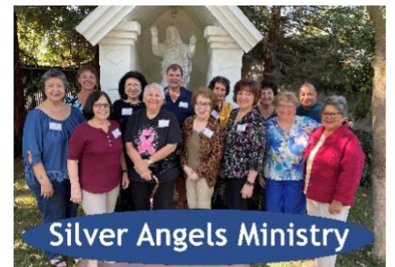
Silver Angels Ministry

WEDNESDAY, NOVEMBER 9, 9:30 A.M. TO 12:00 NOON ST. AGNES CHURCH SOCIAL HALL – 111 BIRCH STREET, PINEDALE