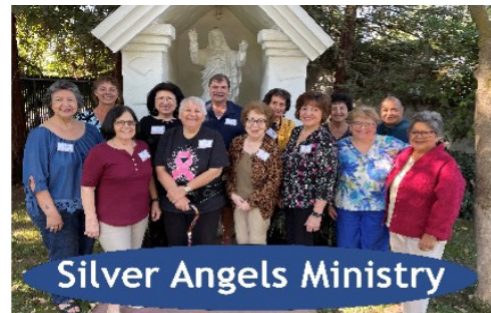
Silver Angels Ministry

WEDNESDAY, DECEMBER 13, 11:30 A.M.-2:00 P.M. ST. AGNES CHURCH SOCIAL HALL – 111 BIRCH STREET, PINEDALE