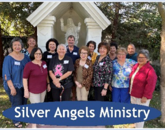
Silver Angels Ministry

Acompáñenos para reflexionar en las lecturas de la biblia y el Evangelio Dominical. "Tu Palabra es una lampara a mis pies, es una luz en mi sendero." Salmo 119