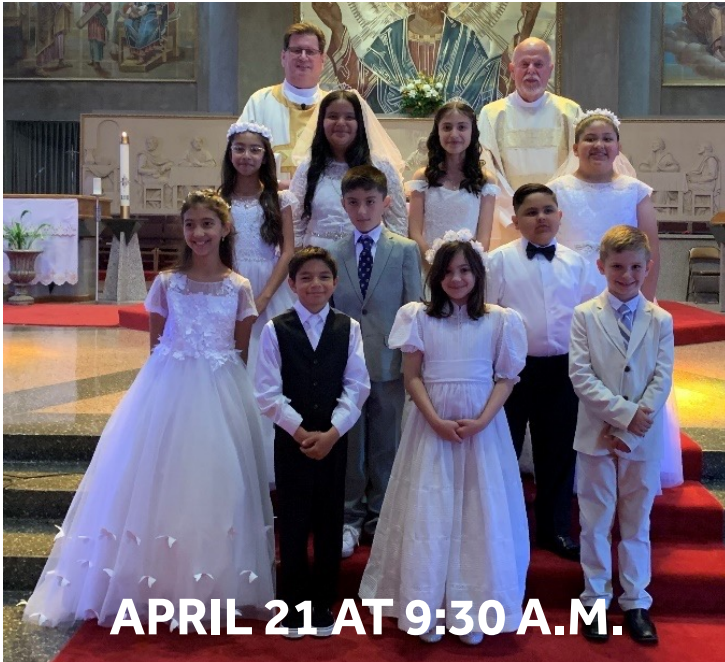
APRIL 21 AT 9:30 A.M.