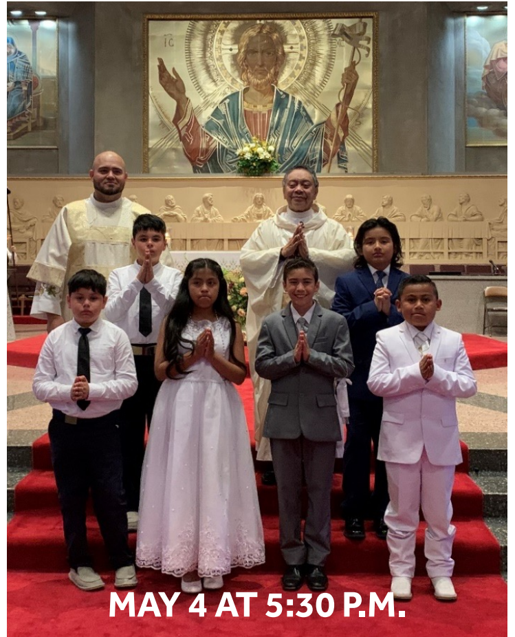
MAY 4 AT 5:30 P.M.