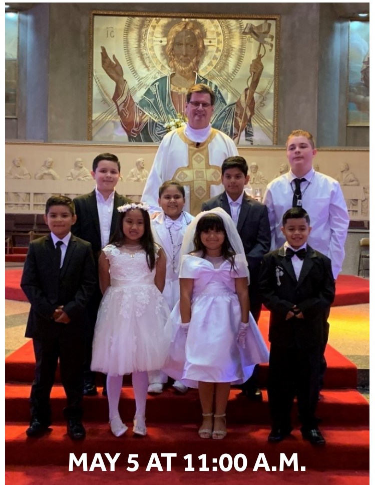
MAY 5 AT 11:00 A.M.