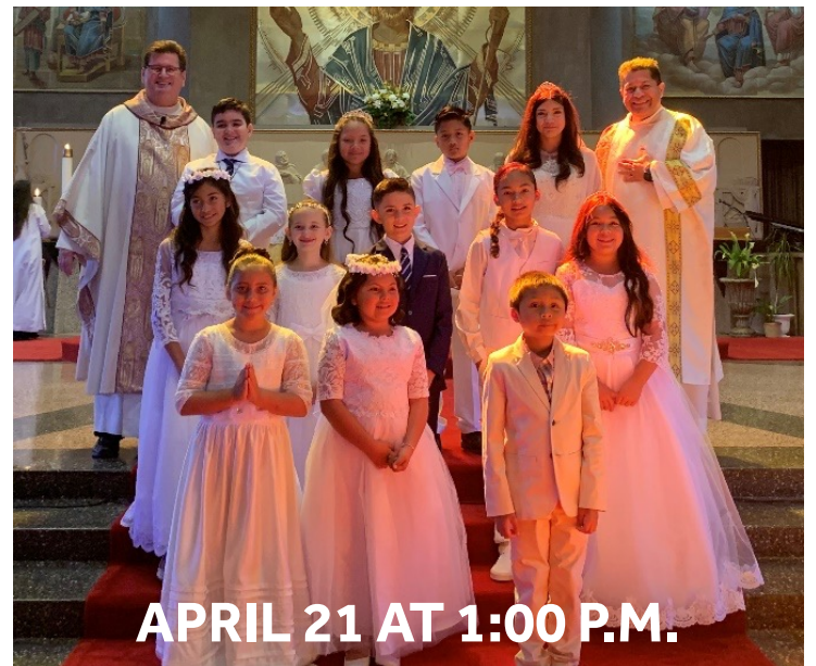
APRIL 21 AT 1:00 P.M.