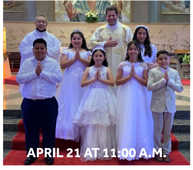
APRIL 21 AT 11:00 A.M.