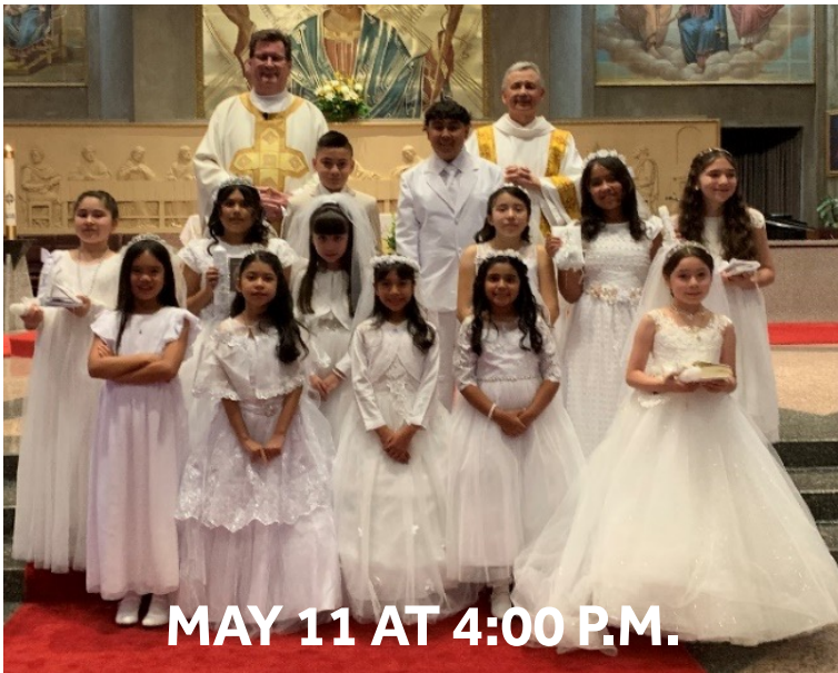
MAY 11 AT 4:00 P.M.