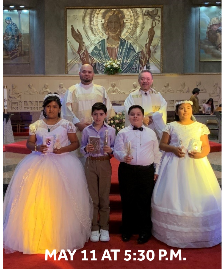
MAY 11 AT 5:30 P.M.