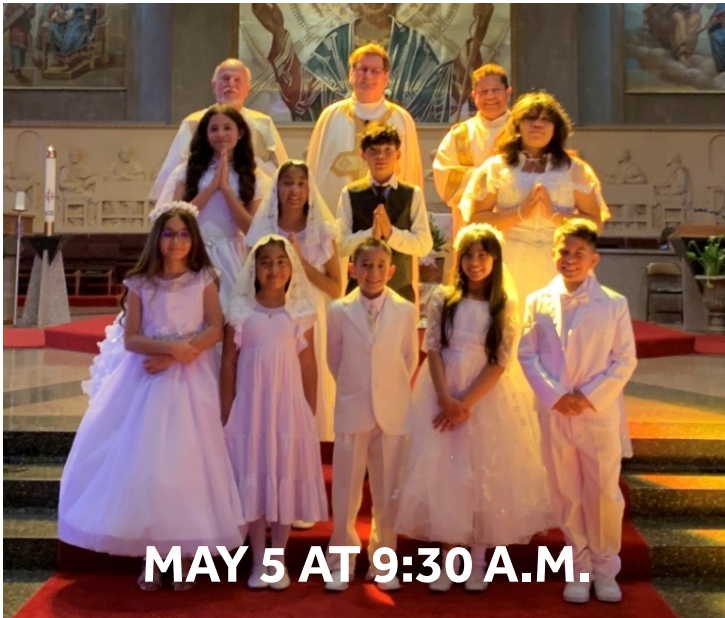
MAY 5 AT 9:30 A.M.