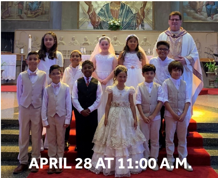
APRIL 28 AT 11:00 A.M.