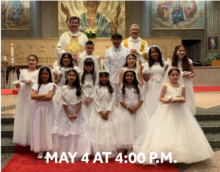
MAY 4 AT 4:00 P.M.