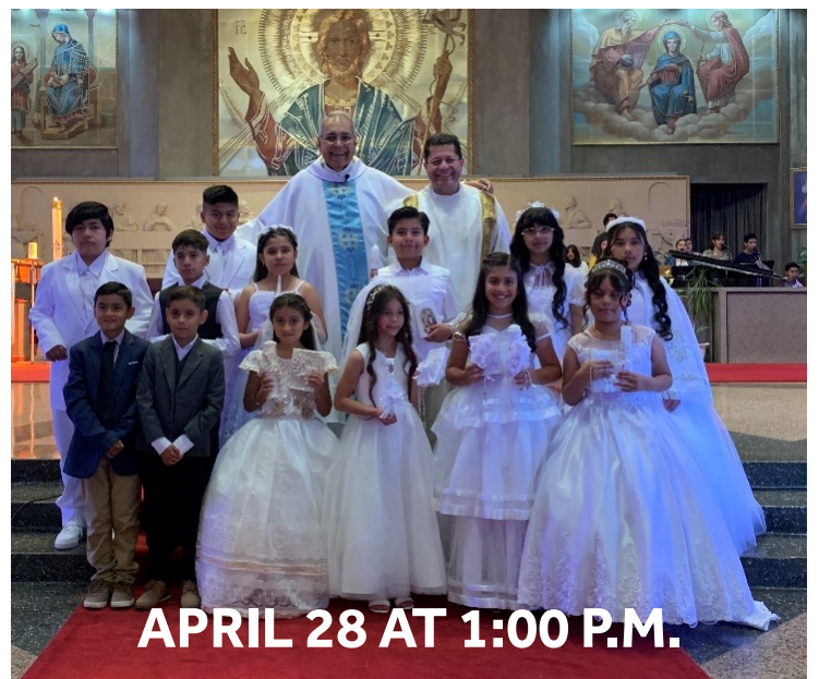
APRIL 28 AT 1:00 P.M.