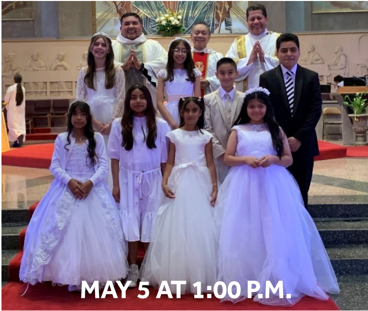
MAY 5 AT 1:00 P.M.