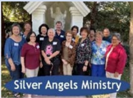
Silver Angels Ministry

Plan to join us on September 11th for fellowship, lunch, and fun.